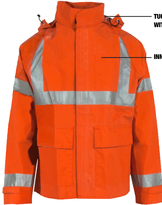
TUCK-AWAY HOOD WITH DRAWSTRING