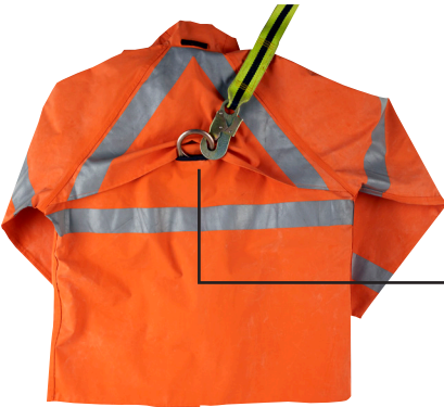
"D" RING ACCESS PORT